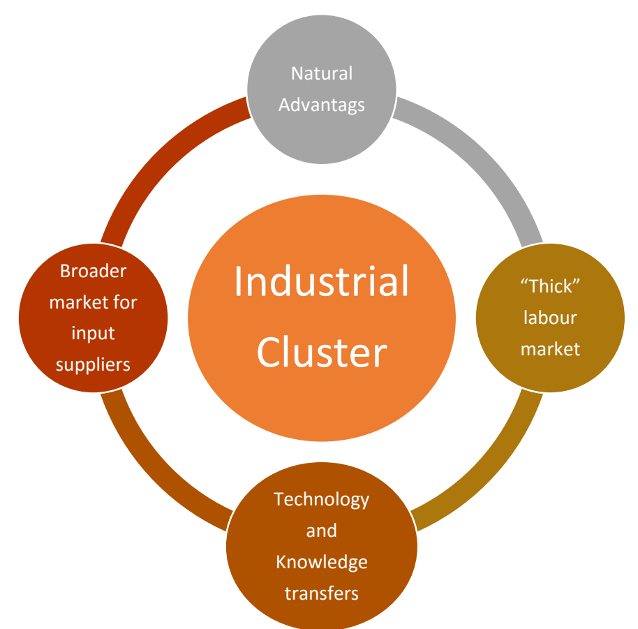
Source: Institute for Strategy and Competitiveness at Harvard Business School, 2011