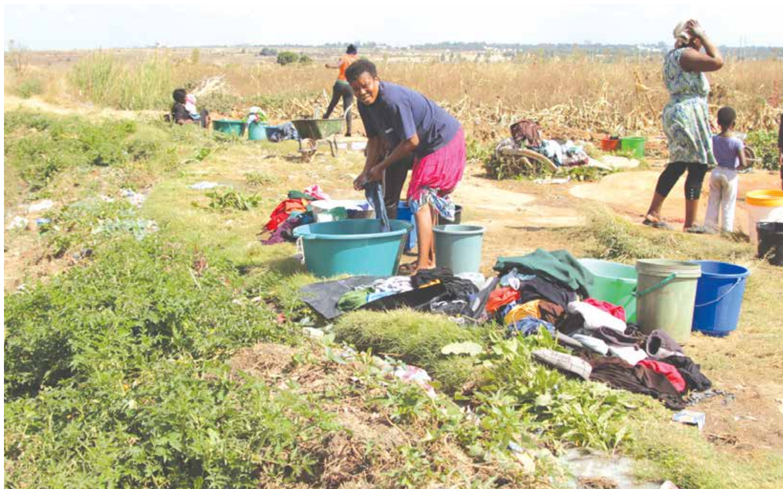
Women doing laundry in an open space. Access to potable water will improve lives

● Dr. Bjørn Lomborg, an adjunct professor at the Copenhagen Business School, directs the Copenhagen Consensus Center, ranking the smartest solutions to the world's biggest problems by cost-benefit. He is the author of The Skeptical Environmentalist and Cool It . His new book is How To Spend $75 Billion to Make the World a Better Place .